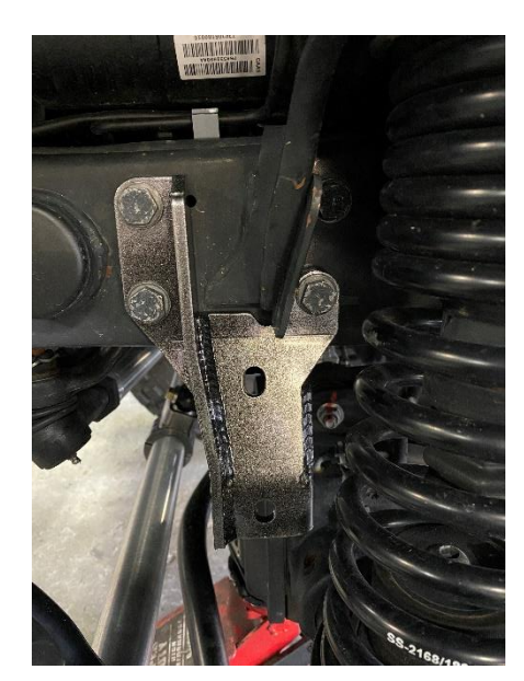
Fig. B Fig. C