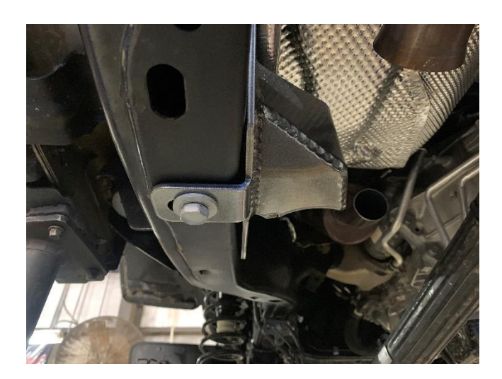
Fig. I Fig. H