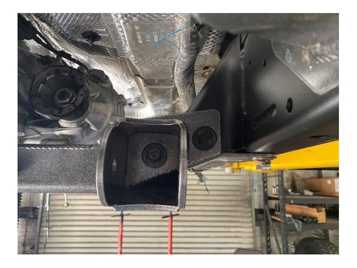
Fig. C Fig. D

8. Start with the driver side of your new WFO Crossmember. Slip it over the factory 2 bolt bracket and insert the factory bolts in the direction of front to back. So, the head of the bolt will be inside the new lower link mount bracket, leave Loose. Fig. C. On some newer models we've noticed you will need to grind off the bottom of the factory bracket so the crossmember sits flat up against the frame especially on 2020+ JT Gladiators and the V8 392 models. Fig. D