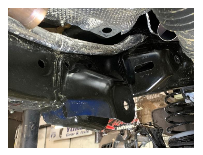
Fig A Fig B