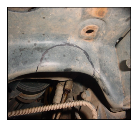
Figure 1 Figure 2 Figure 3

Final Notes: Start vehicle and turn wheels lock to lock several times to check for any signs of binding or unusual noises. Torque on all bolts should be checked after the first few hours of use and then periodically after that.