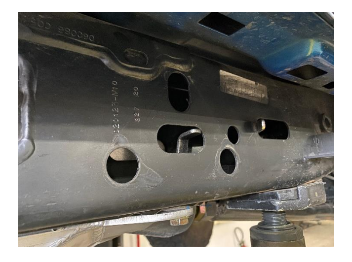
Fig. C Fig. D